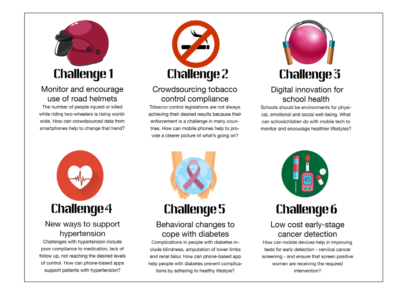
Figure 2 Six specific challenges developed for the Open17 Challenge on health, in collaboration with the World Health Organization and International Telecommunication Union, as part of the Be Healthy Be Mobile initiative (as displayed on the website openseventeen.org).

For a typical edition of the Open17 Challenge, as illustrated in Figure 2, there is an umbrella topic (e.g., "Mobile health solutions for noncommunicable diseases") and a set of specific sub-challenges (e.g., Monitor and Encourage Use of Road Helmets) to incentivize addressing specific pre-identified needs.