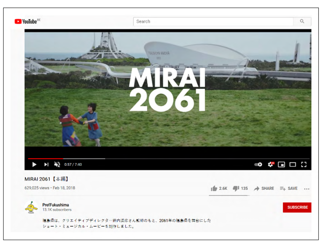
Figure 1 Screenshot of the musical video "Mirai 2061," available at the Youtube channel of Fukushima Prefecture. Behind the two dancing main characters, futuristic buildings are displayed.