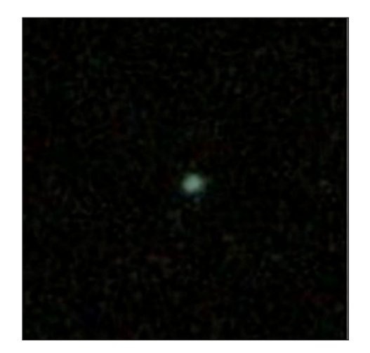
Figure 1: Green Pea: The first Green Pea galaxy posted on the GPAC forum by Hanny on August 12, 2007 (SDSS 2015a).