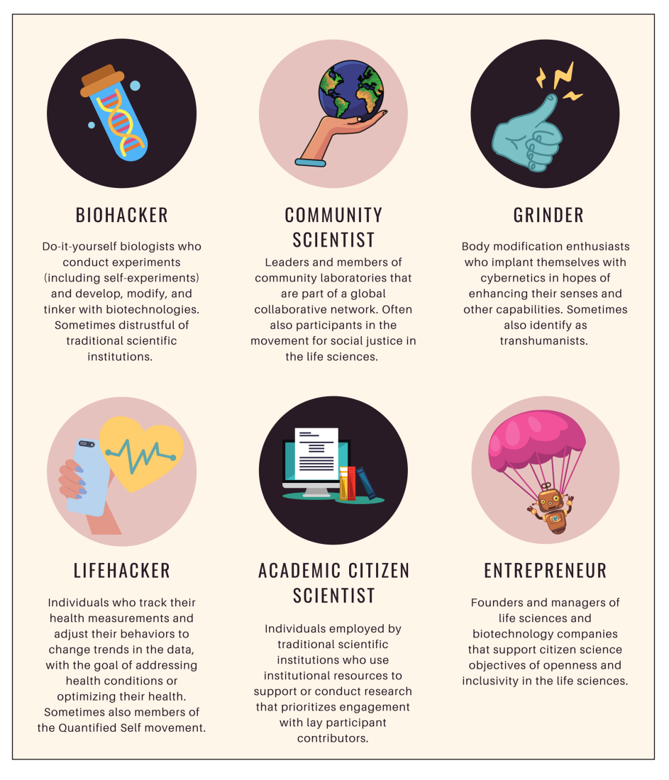
Figure 1 Major biomedical citizen science identities.

the FDA's human research subject regulations apply only to clinical investigations regulated by the agency. Topdown and collaborative citizen science projects generally comply with the Common Rule and FDA human research subject protections because they involve scientists working in traditional scientific settings (such as government, academic, or industry laboratories) where compliance with ethical guidance is mandatory and monitored. Bottom-up biomedical citizen science activities, however, might be conducted with no input from institution-based scientists, are usually not federally funded or supported, and might not qualify as FDA-regulated investigations. Many of these activities are therefore outside the reach of federal ethics review requirements, creating what has been called an ethics gap in citizen science (Rasmussen 2017).