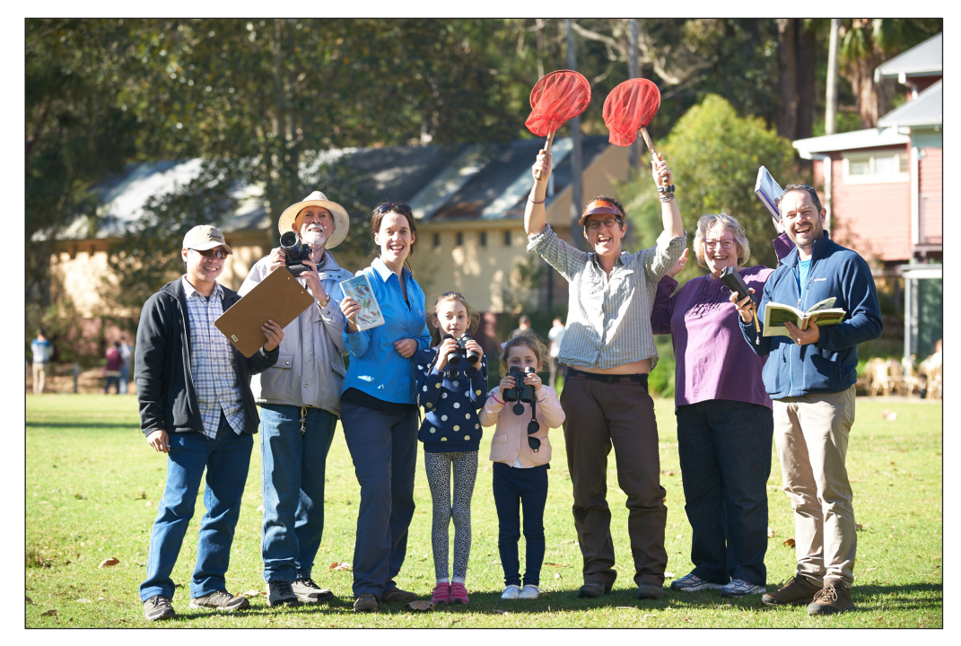
Figure 3: OEH's vision is to drive a new era of public participation in science by developing collaborative, engaging projects that support decision-making.

Developing a public facing policy and strategy was the most important factor in establishing the program and was an important step to position OEH as a leader in this space in Australia. In doing so, OEH staff established a process whereby OEH can measure success and impact of the citizen science program to be able to justify continued investment. It is important to recognise that it takes time to adequately measure program-level outcomes; so upfront and ongoing investment is required to provide stability and continuity to the program. Indeed, the diffusion of science into policy has been recognised as incremental (Rosen 2018), so while the potential for citizen science to provide insight and evidence that informs policy exists, it is often difficult to demonstrate this causal link within short periods of time. To fulfil this potential, citizen science will need to continue to meet the needs of participants, practitioners, and decision-makers. The future of citizen science lies in connecting people, projects, and data, and drawing on co-creation to facilitate mutual agreement. Only then will OEH fully realise its vision of driving a new era of public participation in science by developing collaborative, engaging projects that support decision-making (Figure 3).