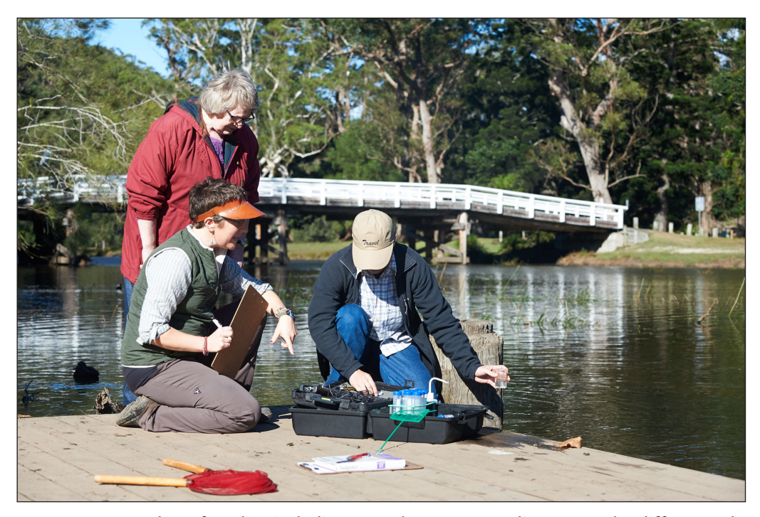
Figure 2: OEH set up a number of studies including several on water quality to test the differences between data collected by professional scientists and data collected by citizen scientists.

Similar to the primary policy challenge reported in Hyder et al. (2015), the main issue that OEH scientists identified was concerns about the quality of citizen science data in terms of accuracy, appropriate metadata, and ease of access. They recognised that efficient sharing of citizen science data required systems that could support the providers and custodians of data and would have the capacity to aggregate data. They also understood the need for data to be highly useable, and felt that the addition of data discovery, visualisation, and analytical tools were crucial to the program's success. Presently, OEH can receive community data through a number of web portals and applications, although these are not necessarily connected or intuitive. To address this, OEH used the results of the user-centric testing described earlier and undertook steps to modify the way that data are input, stored, and output so that the public can receive feedback and data can be used and interpreted. To do this, OEH is partnering with the NSW