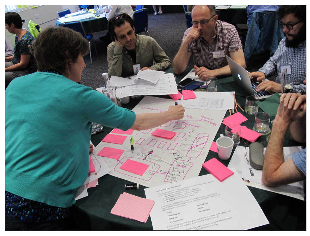
Figure 1: DITOs European stakeholder roundtable on environmental citizen science, May 2018, London.

This paper uses empirical observations from the DITOs project to articulate a broader argument about the relationship between CS and governance processes. It uses a mixture of social science methods including autoethnography (Ellis, Adams, and Bochner 2011) to reflect on stakeholder roundtables, textual analysis (Nimmo 2011) to examine the policy framing of DITOs, and ethnographic observations of devices (Law and Ruppert 2013) when reporting on workshops. Based on these observations and vignettes from the DITOs activities, we outline four governance modes of how CS and governance relate. Taken together, these four modes constitute a heuristic of